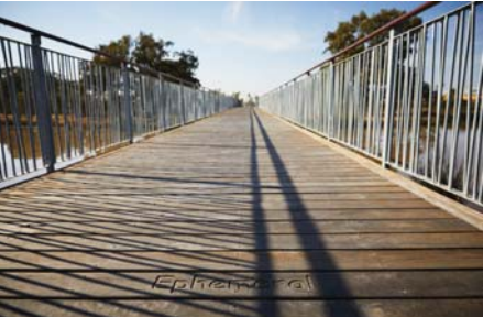
Stories and site information embedded across the site.

.....a water story connecting across the landscape