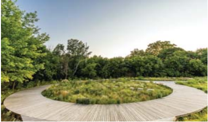
Naval Cemetery, Brooklyn US - Nelson Byrd Woltz LA