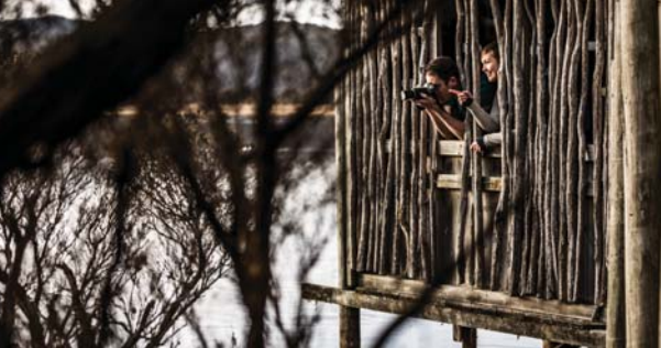
Bird Hide Walk - Narawntapu National Park, Tasmania