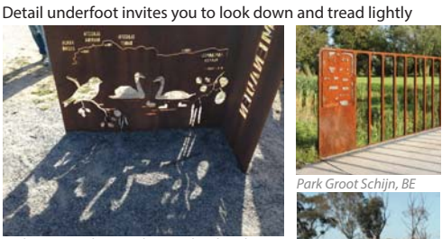
Detail underfoot invites you to look down and tread lightly