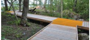
Malarprimenaden, Sweden, Land Architekt AB