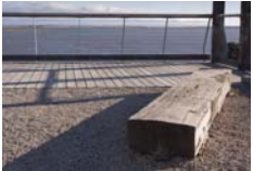
Connewarre Reserve- Inla