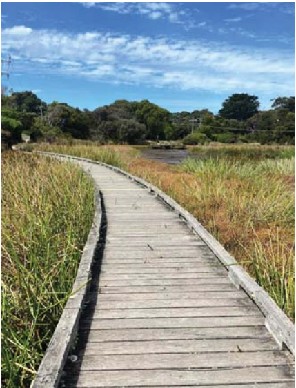
Structures emmerge into the site as vegetation establishes.