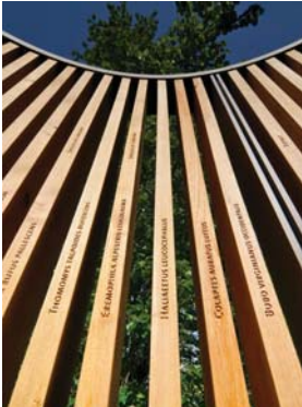
Bird Blind, Portland USA, Maya Lin LA