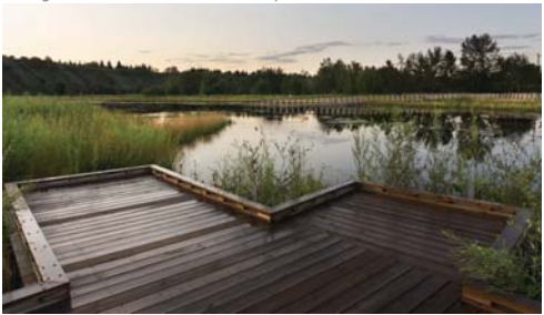
Bird Hide - a simple structure sits quietly in the landscape