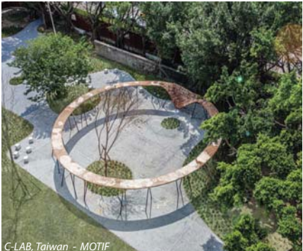
C-LAB, Taiwan - MOTIF