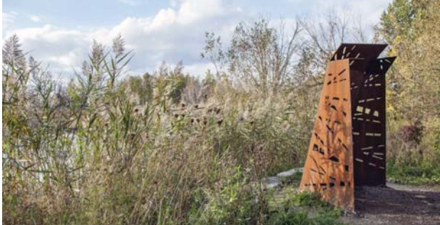
East Point Bird Sanctuary, Toronto - Branch Plant