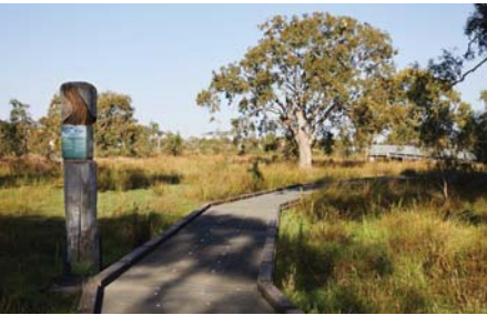
Harpley Discovery Trail, Werribee - GbLA