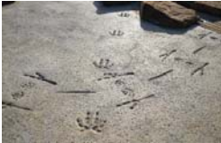
Royal Park Nature Play, City of Melb.