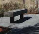
Aminge-Ullna Forest Park, Sweden - Topia LA