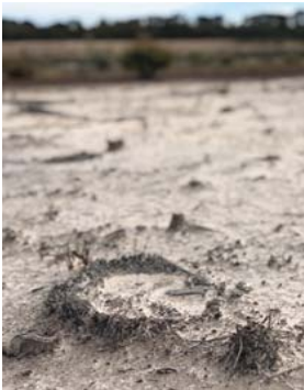
Remnant Grasree stumps across the basin provide habitat for emerging species, resilient in the continuing story of the landscape. An emblem that can be expressed across the site.