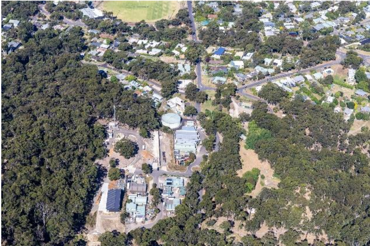
Lorne water treatment plant